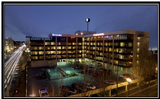
Red Lion Hotel Portland – Convention Center

Our hotel is the Red Lion Hotel Portland - Convention Center, and the room rate is $79/night (plus tax).